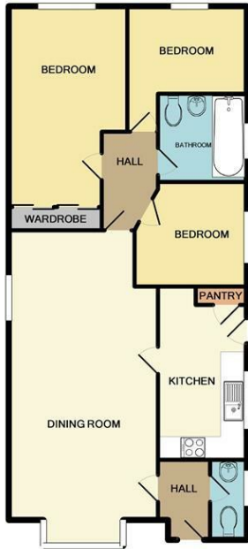
4 DAWN VIEW TROWELL PARK NOTTINGHAM NG9 3QU Whilst every attempt has been made to ensure the accuracy of the floor plan contained here, measurements of doors, windows, rooms and any other items are approximate and no responsibility is taken for any error, omission, or mis-statement. This plan is for illustrative purposes only and should be used as such by any prospective purchaser. The services, systems and appliances shown have not been tested and no guarantee as to their operability or efficiency can be given. Made with Metropix ©2015